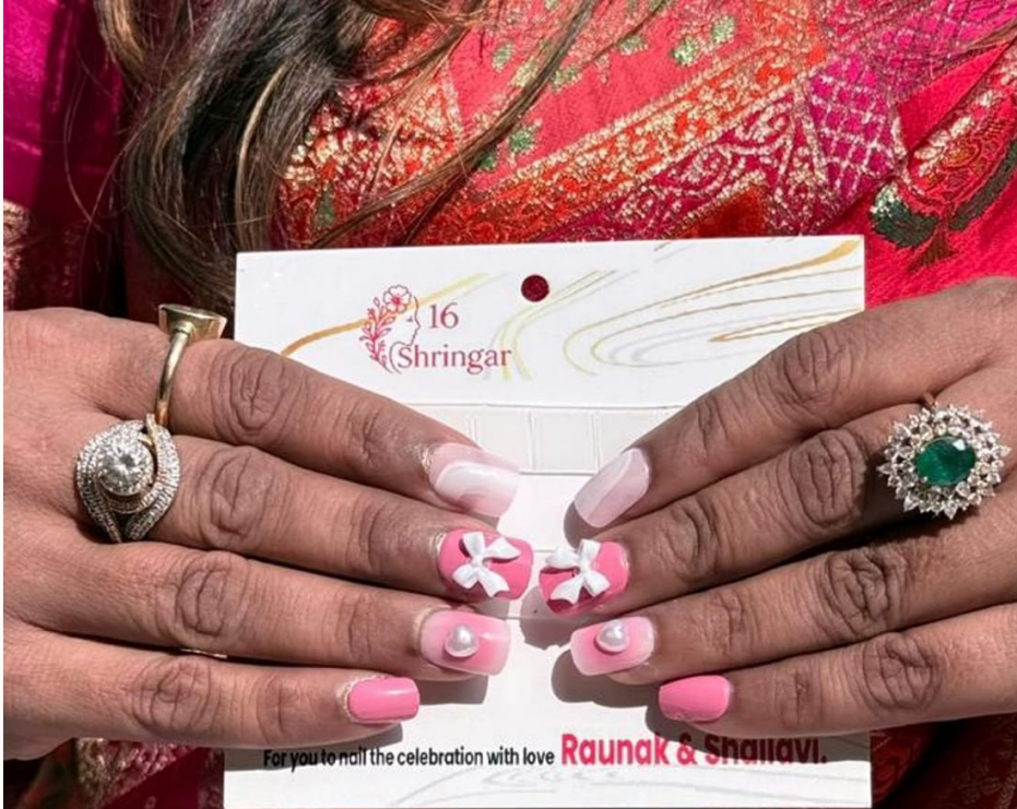
Nail cards and press-on guest moments