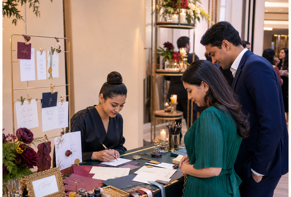
Creative live station and personalisation